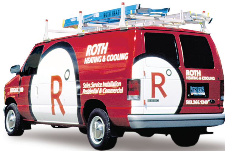
^ Fleet graphics