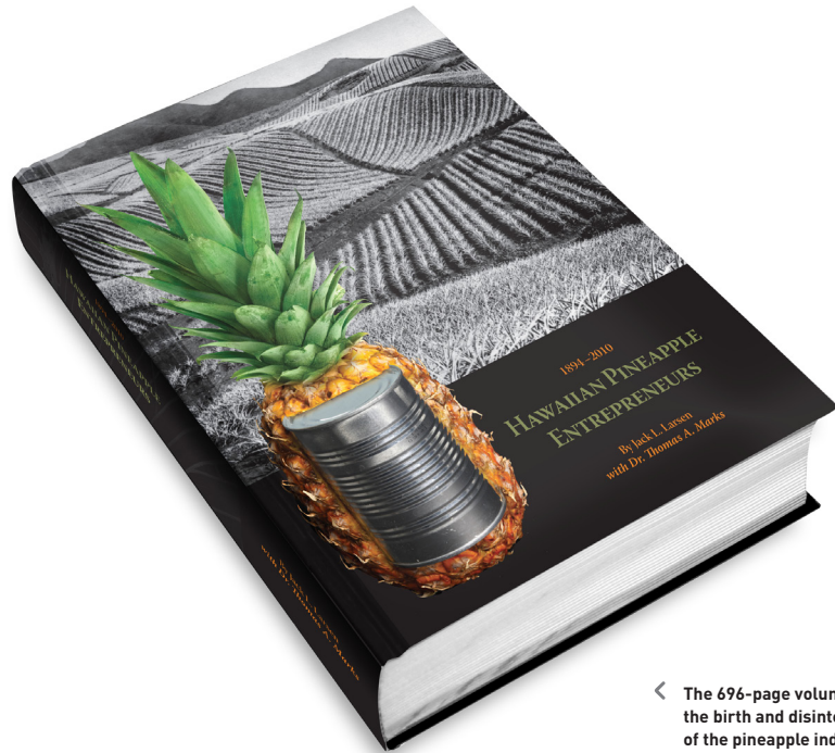
◀ The 696-page volume chronicles the birth and disintegration of the pineapple industry in the Hawaiian Islands.