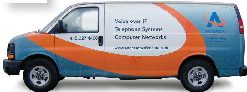
Business cards, information sheets and fleet graphics