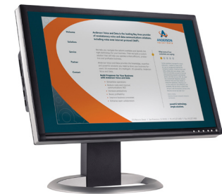
Logo in stacked and horizontal version, Website